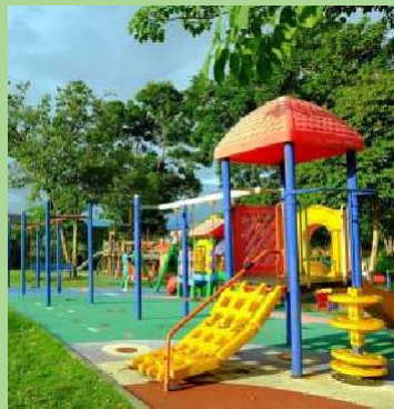
Kids' Play Area