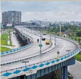
Shilphata Junction Tunnel

This junction will have an underpass along the Mumbai-Panvel Highway.