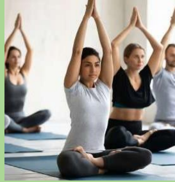
Yoga & Meditation