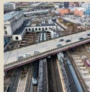
Virar Alibaug Multimodal Corridor

The road is set to be widened to 60m, making it a 10-lane highway.