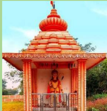
Temple within the premises