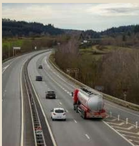
Airoli Katai Highway

Codename Bumper Gains is also a smart investment for the future considering its potential for appreciation. Several infrastructure and rail projects are in the pipeline which will transform its real estate value.