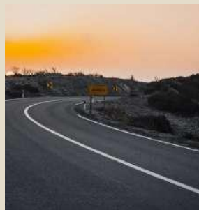
Kalyan-Shil Road Widening

This flyover will connect the Airoli Katai Tunnel with Mhappe.