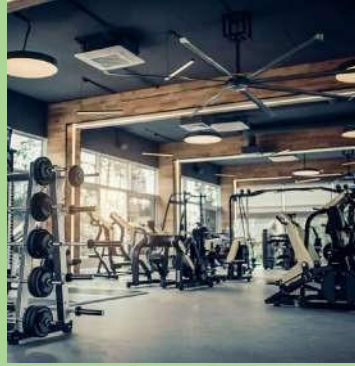
Indoor & Outdoor Gymnasiums