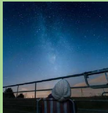
Star Gazing Deck