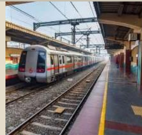
Metro Line 12

Catch the Vikroli-Badlapur Metro right at your doorstep.