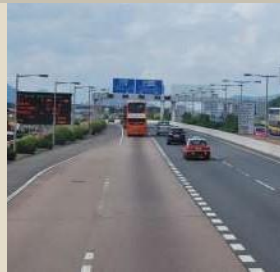
Mumbai-Pune Highway Widening

This junction will have an underpass along the Mumbai-Panvel Highway.